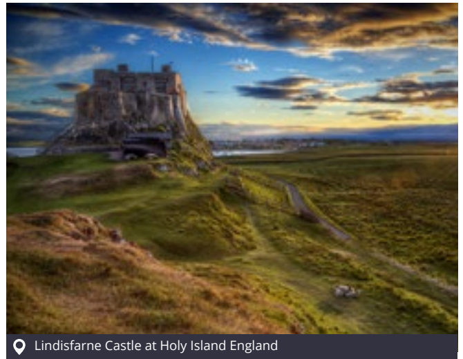
Lindisfarne Castle at Holy Island England

There are two sections in the Plan currently open to new joiners. Both sections are defined contribution pension arrangements. The chart below explains the differences.